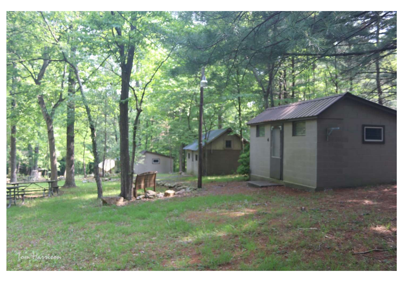
Bunk House Cabins