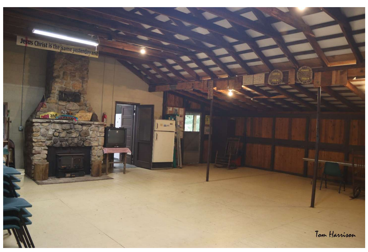
Dining Hall (has chairs and tables)