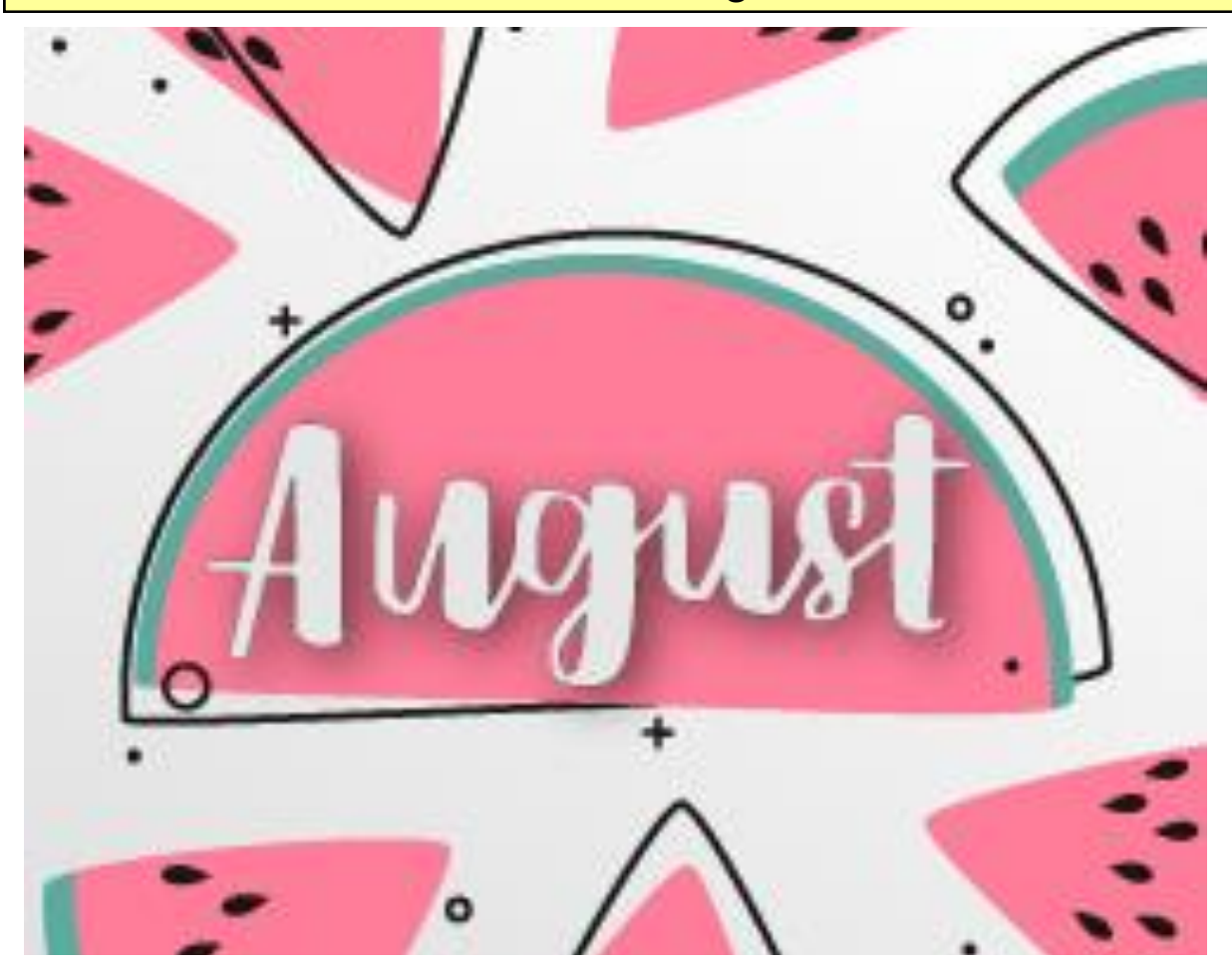
A publication of St. John's United Church of Christ Chambersburg, Pennsylvania