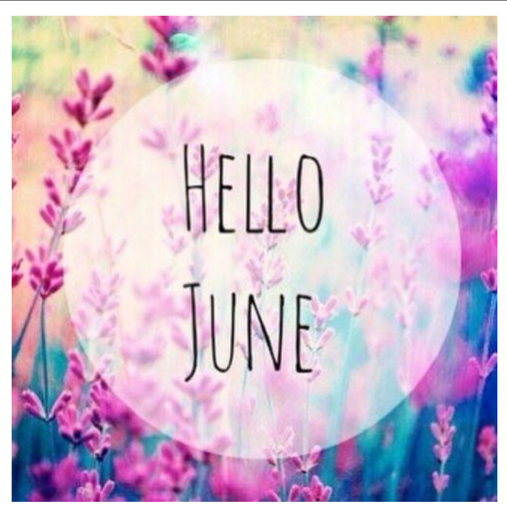
A publication of St. John's United Church of Christ Chambersburg, Pennsylvania